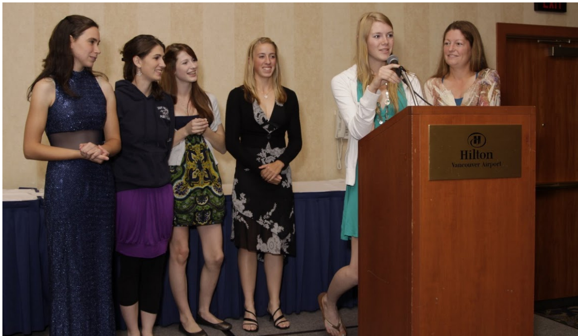
The Nova Scotia Team Inviting Everyone to Quiz 2010 in NS next October.