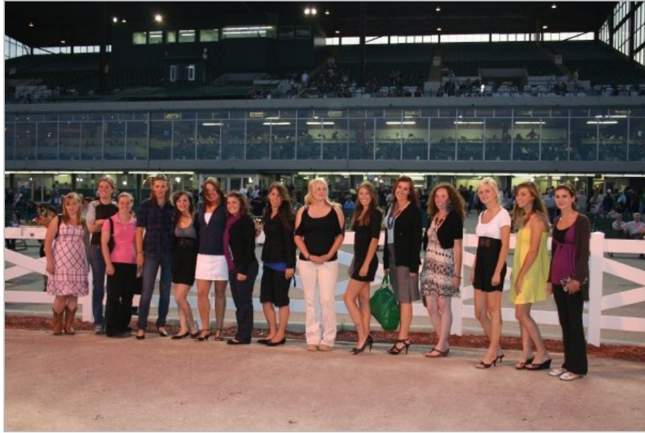
All the participants at the Assiniboia Downs Raceway