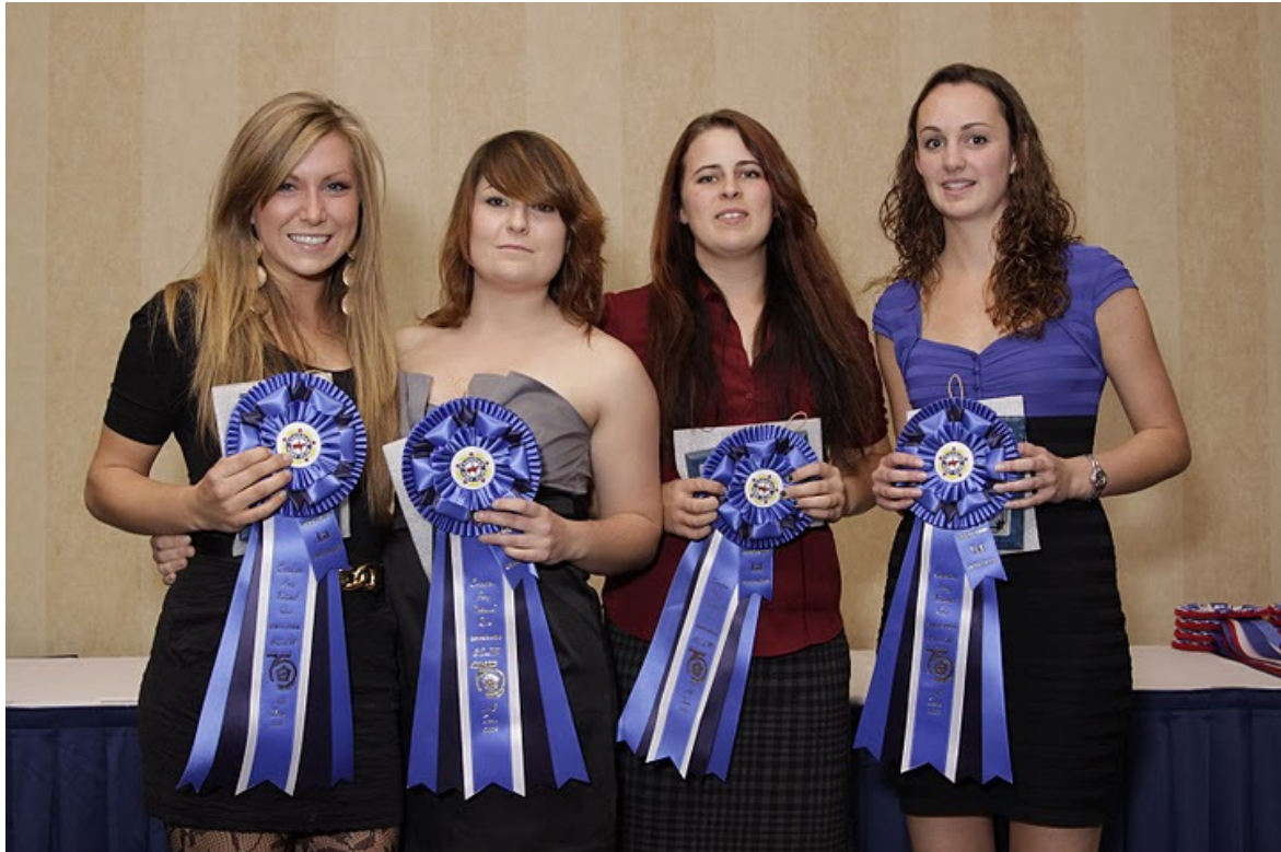
1 st Place A/B Team - SLOV