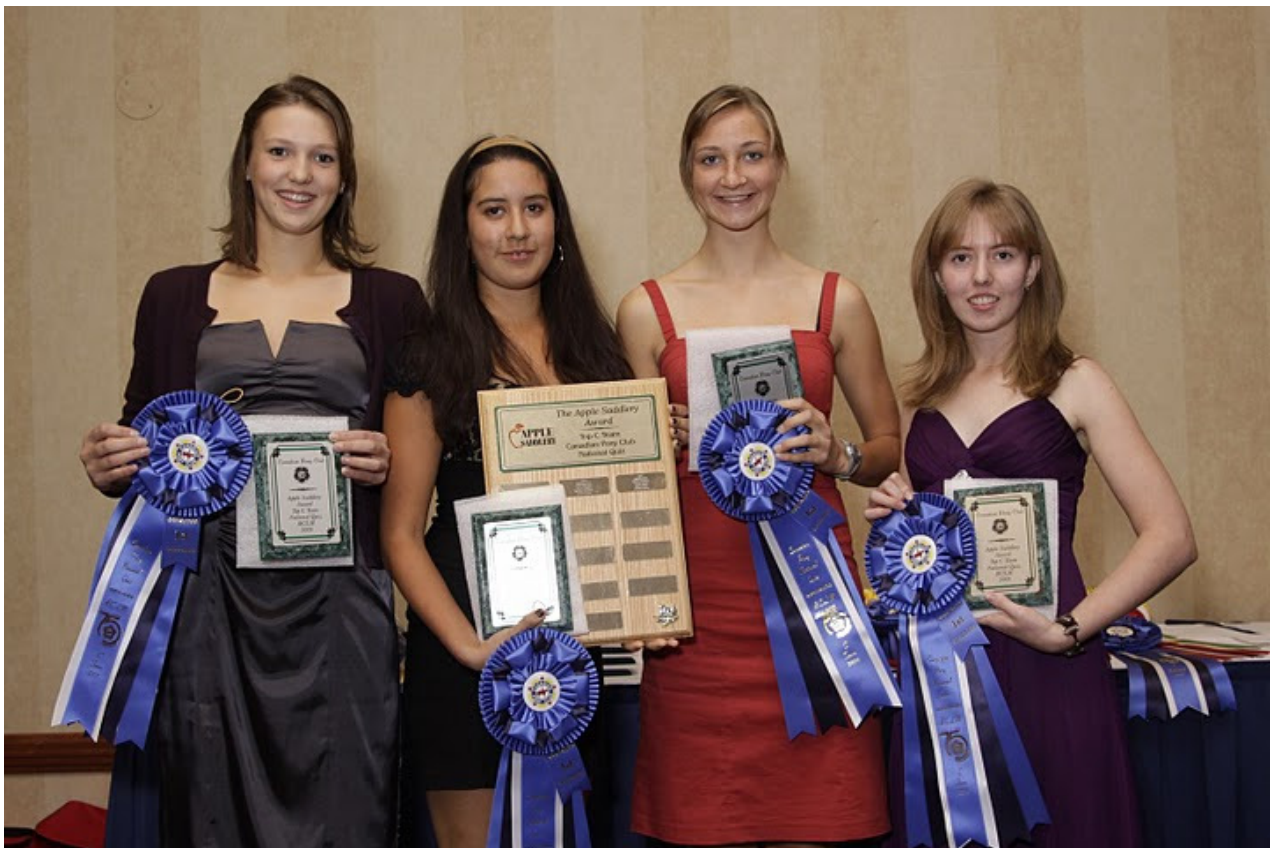
1 st Place C Team - BCLM