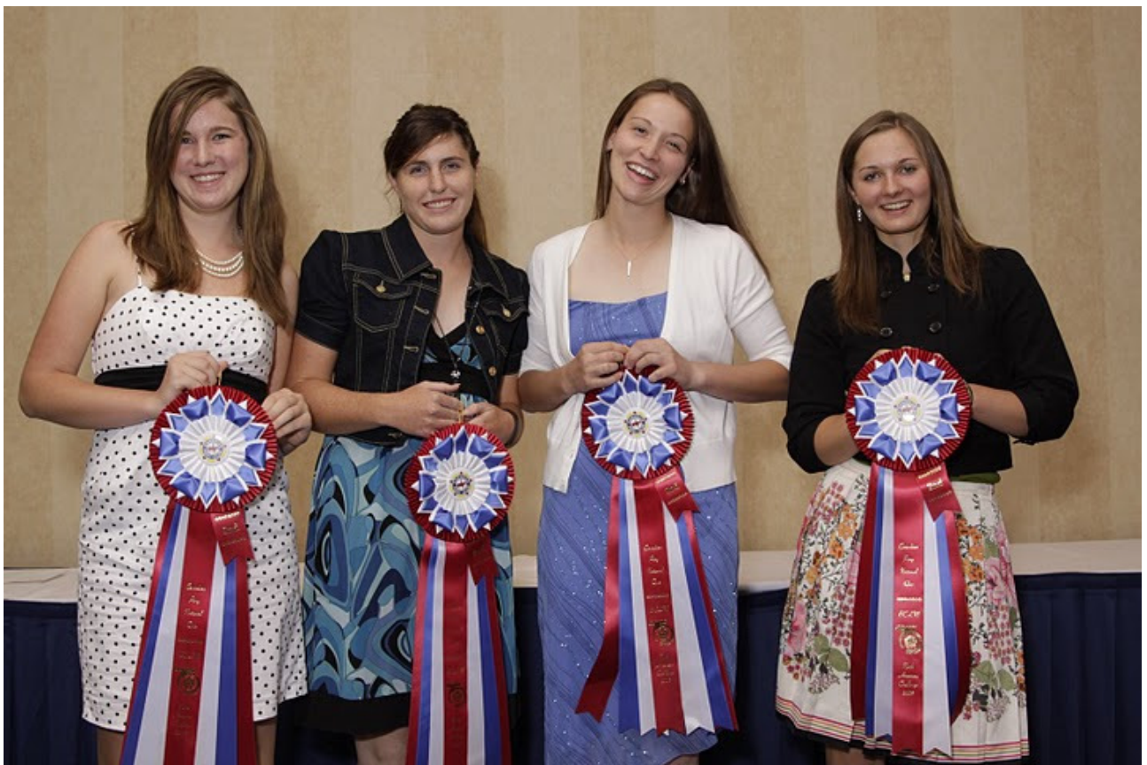
North American Challenge 2nd Place – US