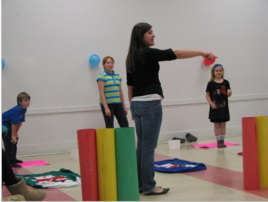
The 3 finalists of the Amazing Race.