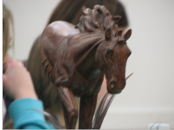
The Participation Trophy