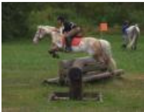
BC Senior Owner/Rider