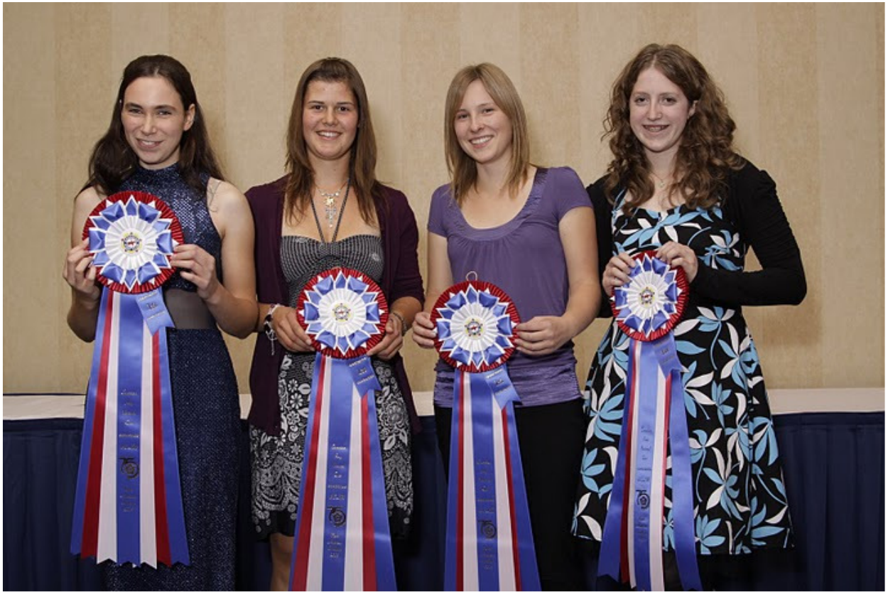
North American Challenge 1st Place - Canada